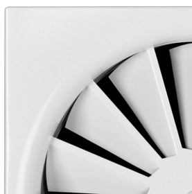
WITH DISCHARGE NOZZLE