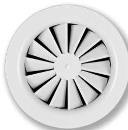
CIRCULAR DIFFUSER FACE