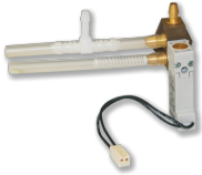
EXPANSION MODULE EM- AUTOZERO