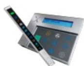
Beleuchtungsschaltung über Bedieneinheit