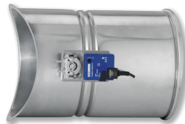
CONNECTION TO CIRCULAR DUCTS