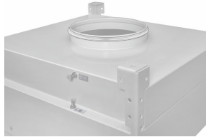
Circular spigot with lip seal