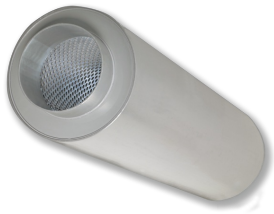
CIRCULAR SILENCER TYPE CAK