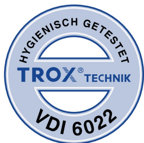
TESTED TO VDI 6022