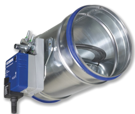
SHUT-OFF DAMPER, VARIANT AK, WITH ACTUATOR