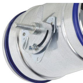
VARIANT FOR MANUAL OPERATION