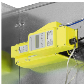
ATEX-COMPLIANT PARTS AND UNITS