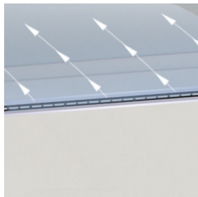
ANGLED ONE-WAY AIR DISCHARGE