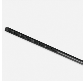
INSTALLATION IN CONTINUOUS CEILINGS