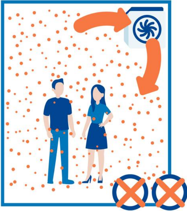
„Room air conditioner“ without filtration

Air conditioning systems without fresh air, without filters, or with only inadequate filters, do not reduce the virus load in a room.