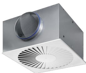
SQUARE DIFFUSER FACE WITH SQUARE PLENUM BOX

Circular diffuser faces with circular plenum box