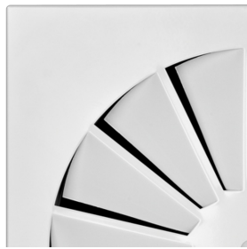
WITHOUT DISCHARGE NOZZLE