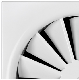
WITH DISCHARGE NOZZLE