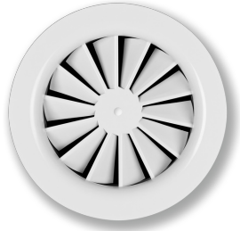
CIRCULAR DIFFUSER FACE