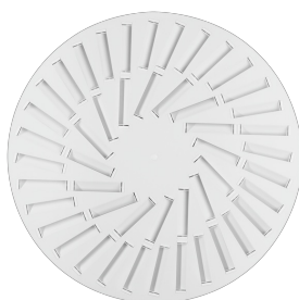
Circular diffuser face with white air control blades