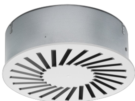
Circular face style with circular plenum box and top entry spigot