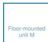
Floor-mounted unit M