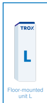
Floor-mounted unit L